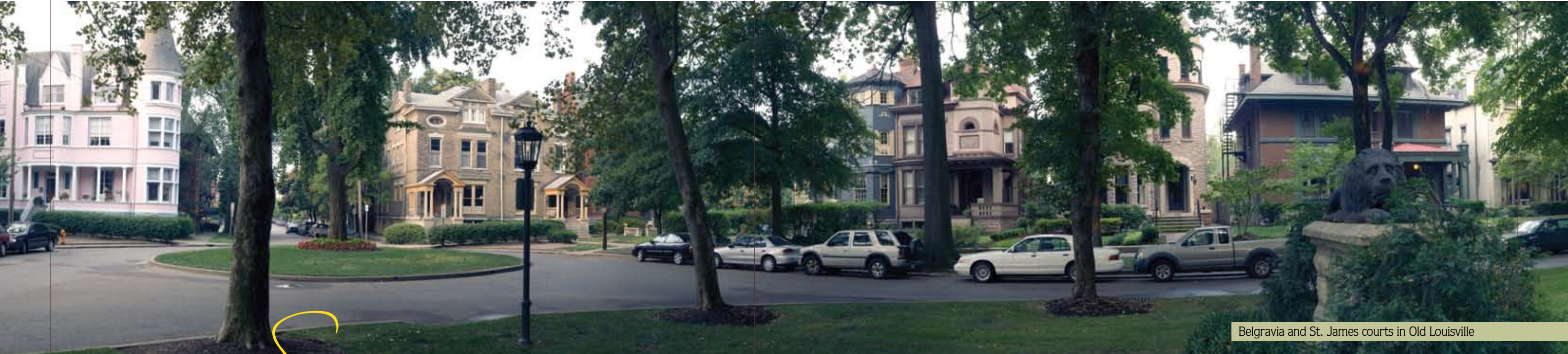
Belgravia and St. James courts in Old Louisville

Strolling along the central esplanade of St. James Court , under the shade canopy provided by pin oaks, poplars, sycamores and maples and surrounded by stone and glazed brick mansions and former apartment houses, you might think you're in Charleston or Savannah. Actually, St. James and its Old Louisville pedestrian-court sister, Belgravia , were designed in 1890 to mimic the residential parks of London, England, drawing successful artists, writers and political officeholders as buyers and renters. Today, given the dearth of walk-to shopping and at-night personal-safety shakiness, it's lost a bit of its magnetism and market value. Still, Belgravia's walk-ups and St. James' hark-back magic — not to mention the interior details you'll find — are unique to the city. Approximate price range (including condos): $100,000-$500,000.