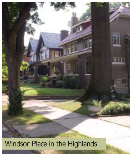
Windsor Place in the Highlands

“For many people, feeling the pulse of life in the midst of a city is the most important concept in selecting a home, be it condo or stand-alone.”