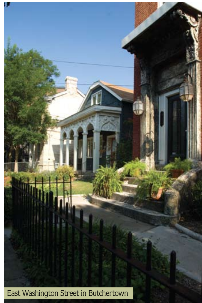
East Washington Street in Butchertown